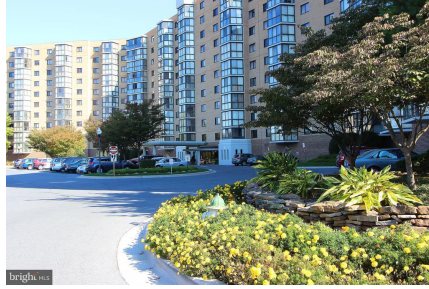
Fairways South front exterior