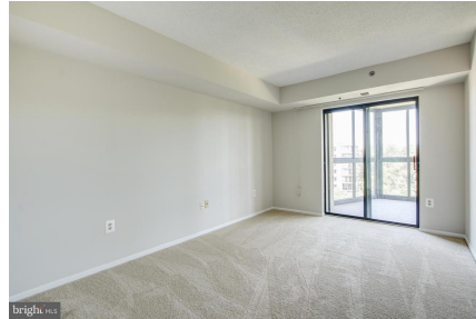
Second bedroom with slider to sunroom