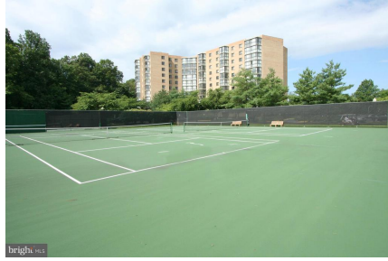
Community tennis courts