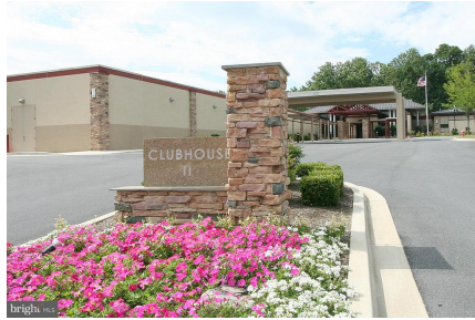
Community Clubhouse II