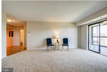
Living room with slider to sunroom