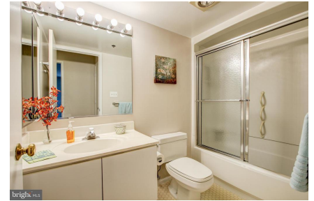
Hall bathroom with tub/shower