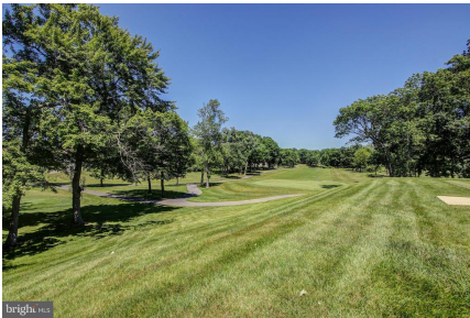
Golf course view from condo