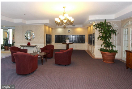
Fairways South building lobby, view 2