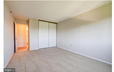
Second bedroom, view 2