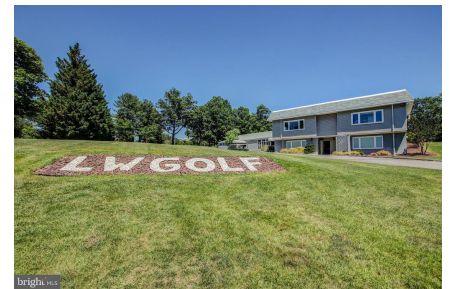
Community golf course