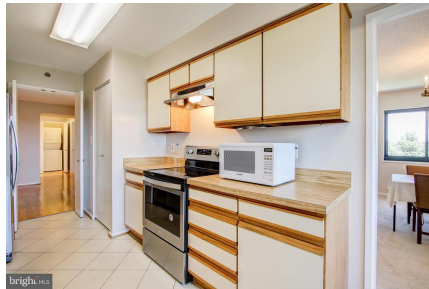
Kitchen, view 2