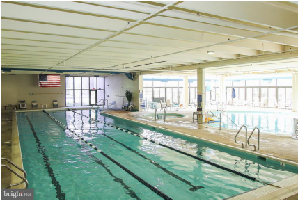
Community indoor pool