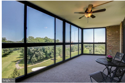
Large glass-enclosed sunroom with golf course view