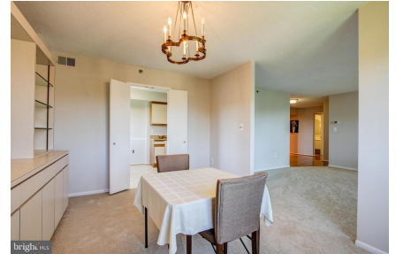
Separate dining room with built-ins