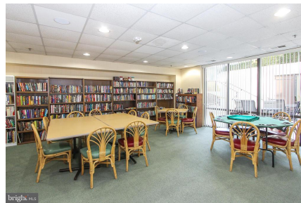
Fairways South library and community room