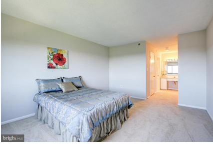
Master bedroom, view 2