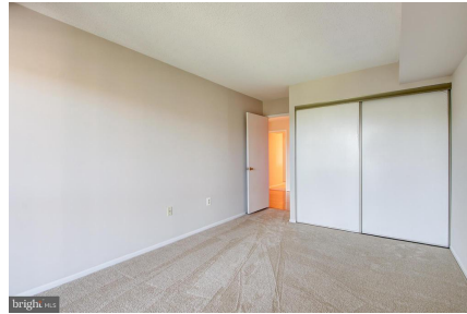
Third bedroom, view 2