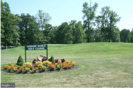
Leisure World 18-hole golf course