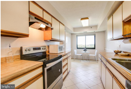
Kitchen with all new stainless appliances