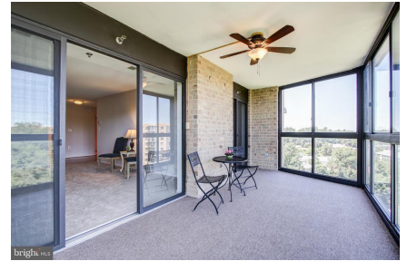
Sunroom with new carpet and ceiling fan