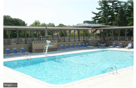
Community outdoor pool