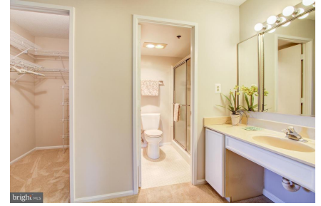
Master bedroom with dressing vanity