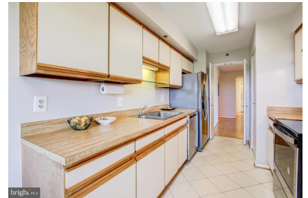
Kitchen, view 3