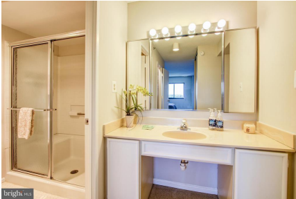
Master bathroom with step-in shower