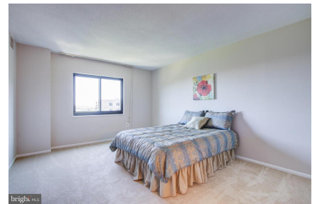
Master bedroom en suite