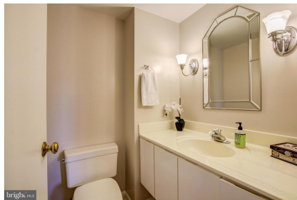
Guest half bathroom