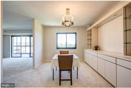
Dining room, view 2