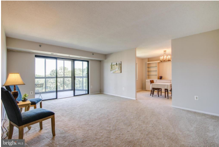
Spacious living room with new carpet