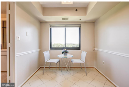
Kitchen table space with large window