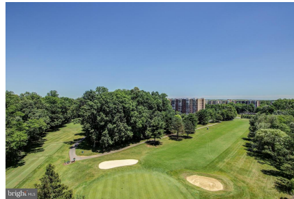
Golf course view from condo