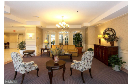
Fairways South building lobby