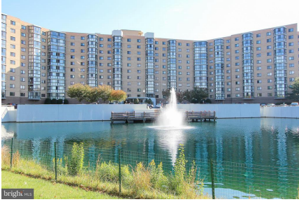
Fairways South building exterior with fountain