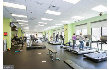
Community fitness center