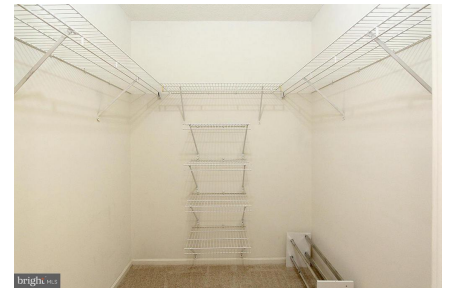
Walk in closet