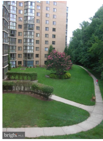
View from the enclosed SunRoom