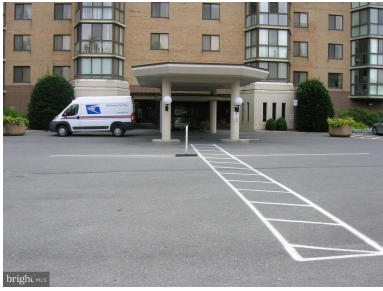
Entrance to Fairways North, Leisure World, Md