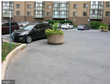
Planters in the parking lot