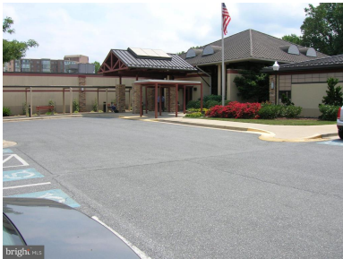
Clubhouse #2 next door