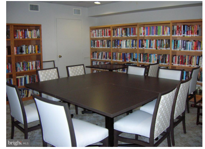
Library for residents use on Entrance Level.