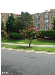
Street View frp, LW Blvd. North