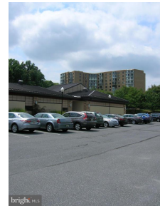
View from Clubhouse 2 parking lo