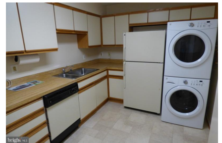
Kitchen w/ New Stack Washer/Dryer