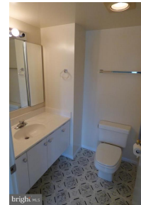
2nd Bathroom w/ Shower