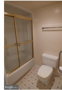
Main Bathroom w/Tub-Shower