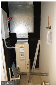
Main Furnace Room