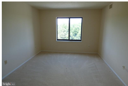
2nd Bedroom rea