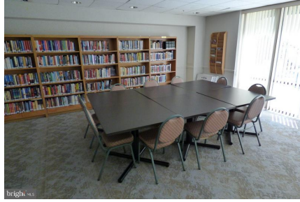
Library Room Area