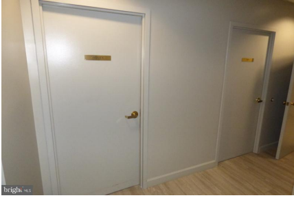
Party Room Restrooms