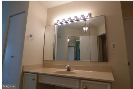
Main Master Bathroom w/closets