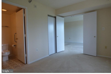
2nd bedroom - 10'x12' w/Full Bath