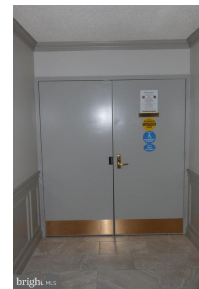
Entrance to Party Room