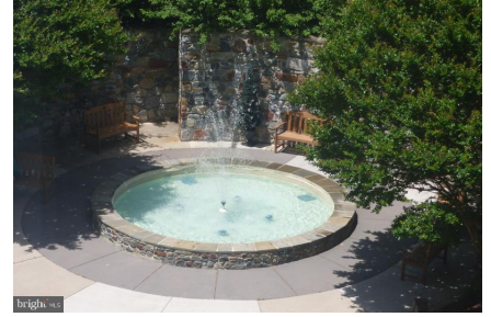
Exterior Area from Party Room