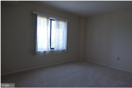
2nd Bedroom w/closet