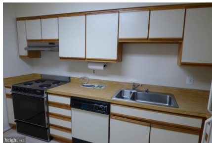
Full Kitchen w/Electric Cooktop