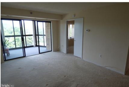
Living Room view to Sun-room