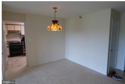
Foyer Entrance to Dining Room