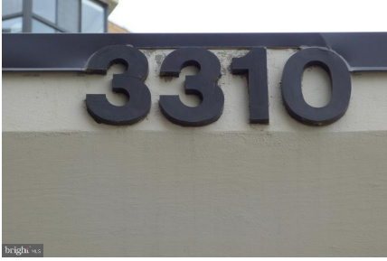
Exterior Front of Condo Building