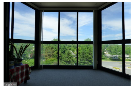
Sun Room View to Front Parking Area