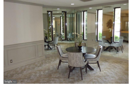
Main Lobby View