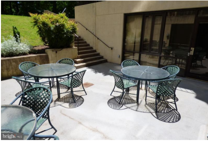
Exterior Lounge from Party Room