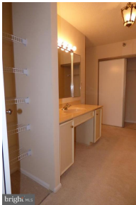
Main Bathroom view