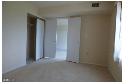
2nd Bedroom view to Living Room