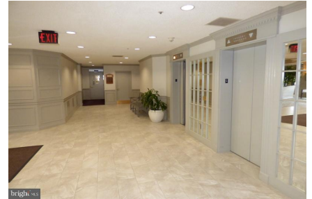
Main Lobby Corridor