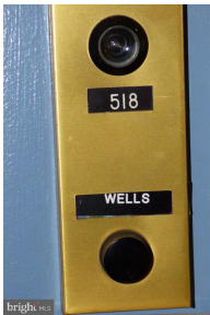
Condo Unit Entrance-Door bell