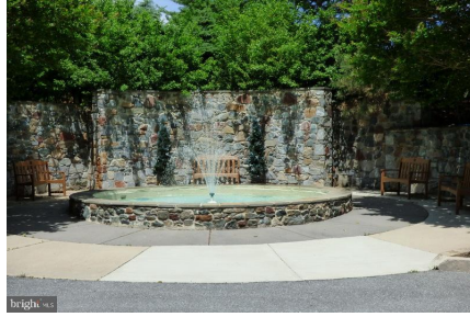
Exterior View of Water Fountain