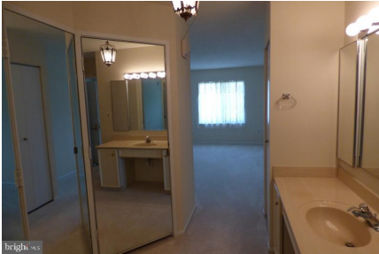
Entrance to Master Bedroom/Full Bath