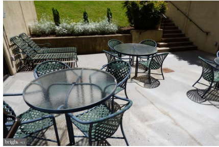
Out Side Lounge Area