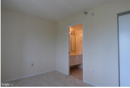
2nd Bedroom w/ Closet