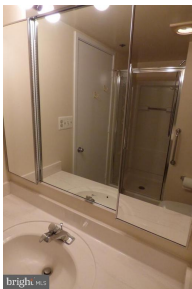
Main Bathroom view