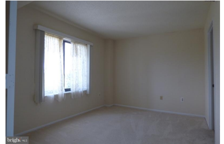
2nd Bedroom- w/closet