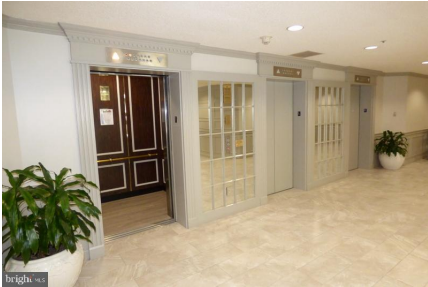
Main Lobby to Elevator