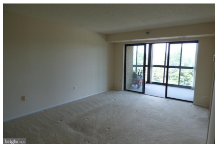
Living Room to Sun-room