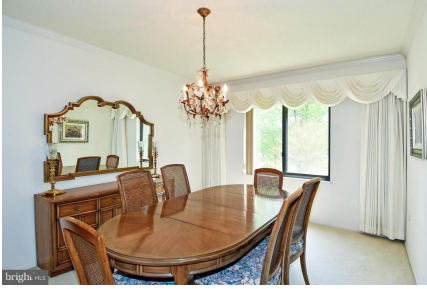
Separate Dining Room