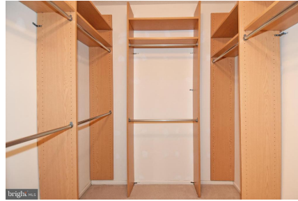
Master Bedroom Walk-in Closet