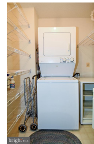
Washer & Dryer