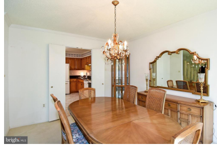
Separate Dining Room