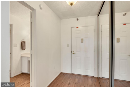
Entryway with huge coat closet