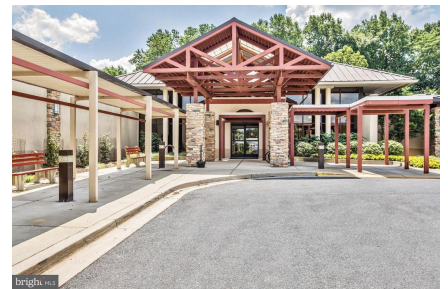
Clubhouse 2 next door