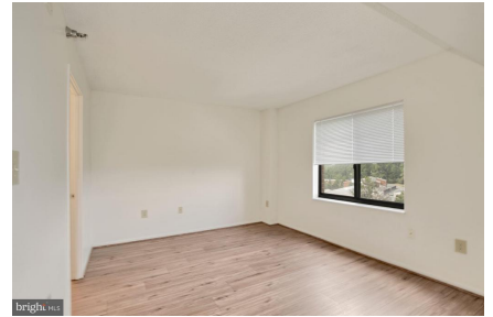
Second bedroom - could be den or office