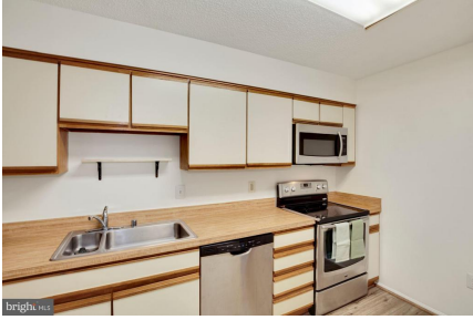
Kitchen has space for table