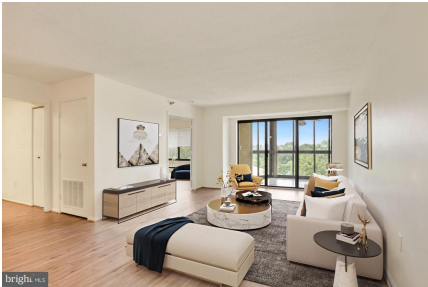
Living room staged virtually