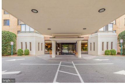
Covered entryway with drive-through