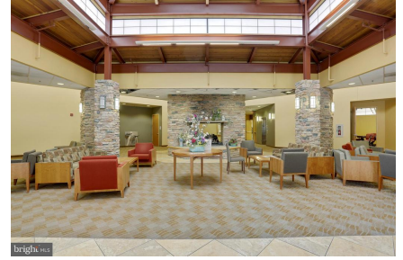
Lounge area in Clubhouse 2