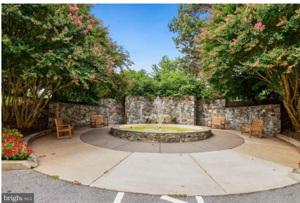
Fountain out front