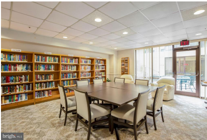
Library in community room