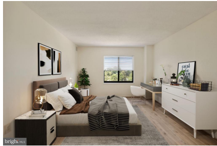
Primary bedroom staged virtually