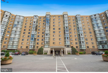
Welcome to Fairways North!