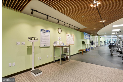
Fitness center at Clubhouse 2