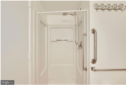
Second bath with step-in shower