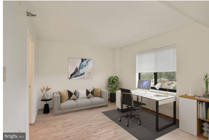
Second bedroom staged virtually