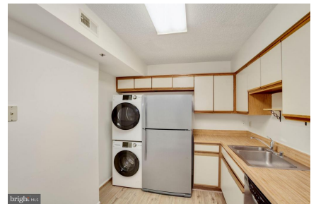
New washer and dryer