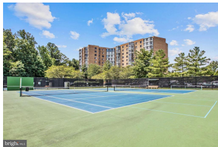
Tennis/pickle ball courts next door