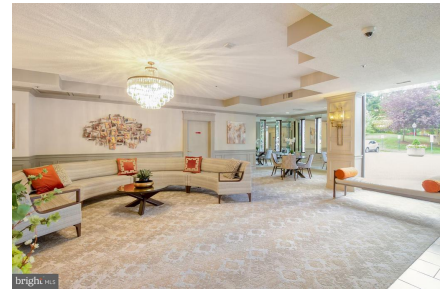
Recently renovated lobby