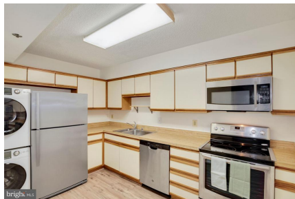
Kitchen with stainless appliances