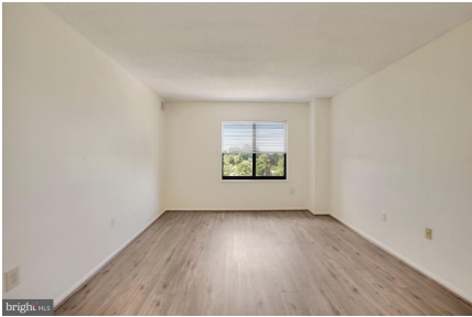
Primary bedroom with walk-in closet