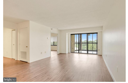
Living room with slider