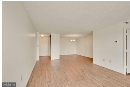
Looking from living room to dining