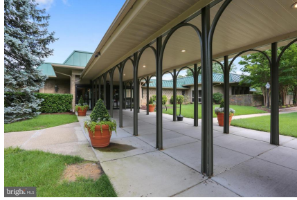
Entryway to Clubhouse 1