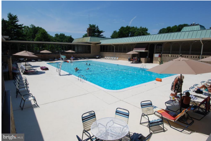
Outdoor pool at Clubhouse 1