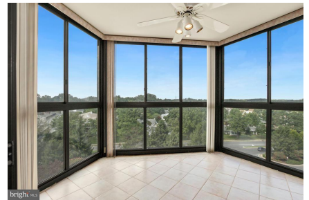
Enclosed balcony overlooking fountain