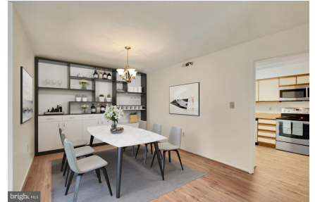
Dining room staged virtually