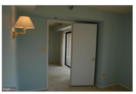
2nd - Bedroom