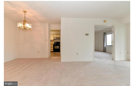
Overall Living Room