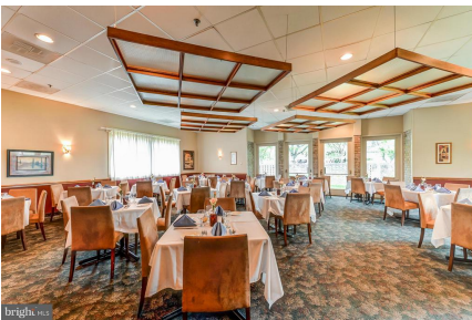
One of three restaurants