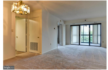
Dining Room/Living Room