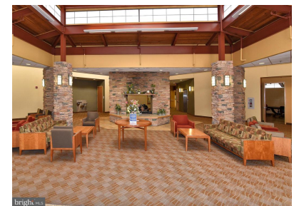
Beautiful club house is a wonderful amenity!