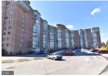
Lots of guest parking for friends and family.