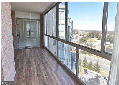
Relax in this sun filled solarium.