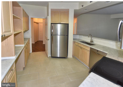
Neutral colors make decorating a breeze!