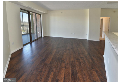
Living room with rich new wood floors!