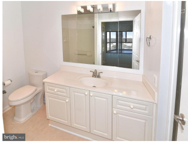
Nice and bright master bathroom!