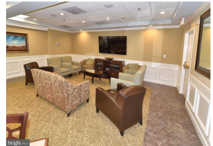
Community room on main floor of your building!