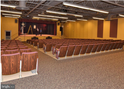
Theater included as part of the amenities.