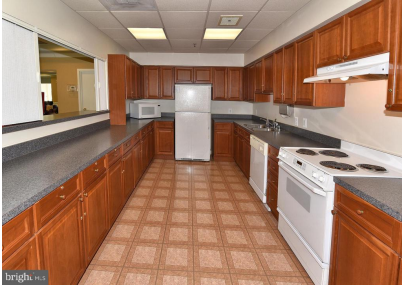
Club house with full kitchen.