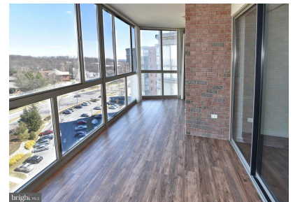
Gorgeous solarium to use year round!