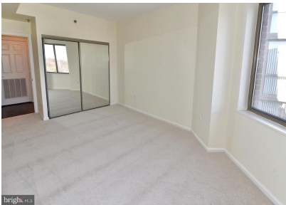
Second bedroom has brand new carpet!