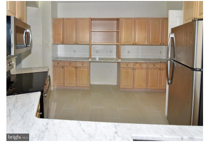
Fantastic kitchen is sure to please!