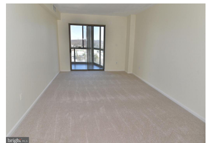
Large master bedroom with brand new carpet!