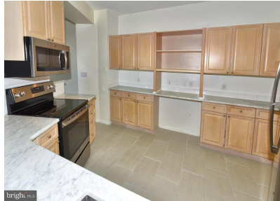
Gorgeous new Carrara marble counters!