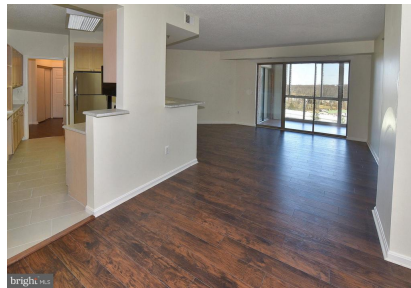
Brand new wood floors in living and dining rooms.