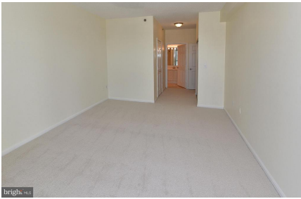
Master bedroom with large en suite bathroom!