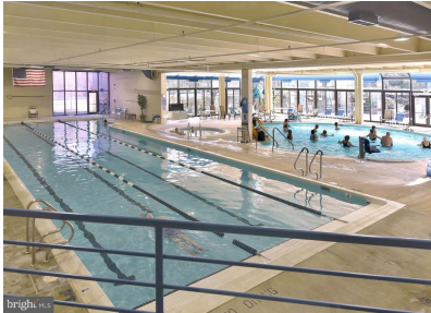
Indoor and outdoor pools included!