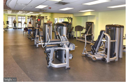
Well equipped gym for your use!