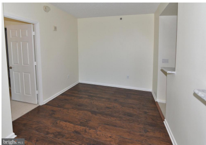
Dining room adjacent to kitchen for entertaining!