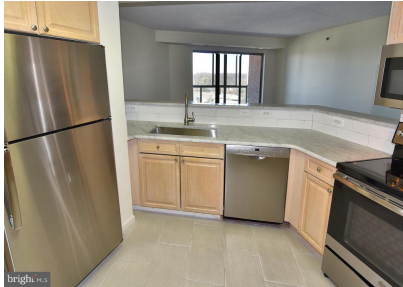
Brand new stainless steel appliances!