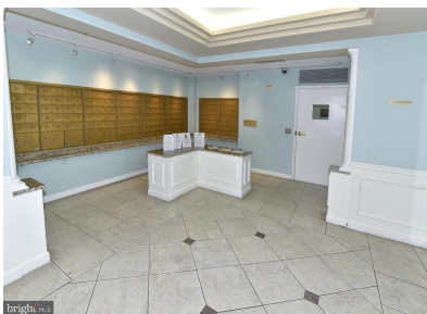
Conveniently located mail room on main floor.