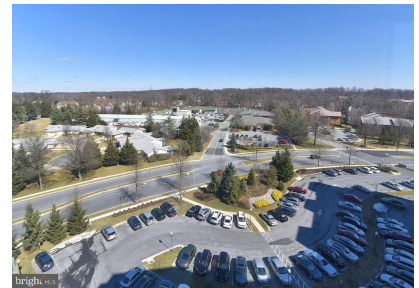
View from your condo.