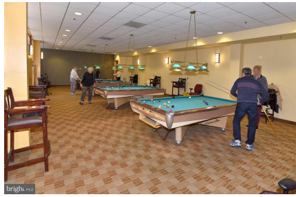
Lots of social activities to take part in.