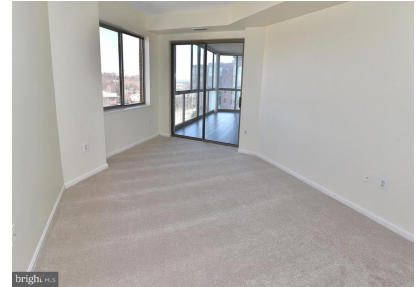
Second bedroom with lots of natural light.