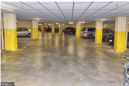
Underground garage space conveys with this condo!