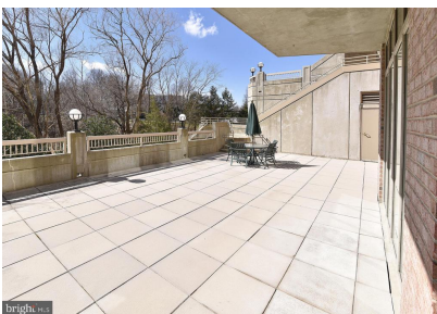
Lovely terrace off community room on main floor.