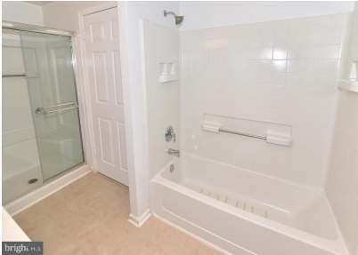
Master bath has separate shower and tub!