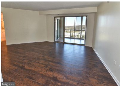
Fantastic light from your sliding glass doors.