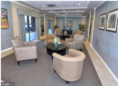
Lovely entrance foyer when you arrive!