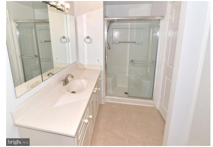
Ceramic tile floors in your master bath.