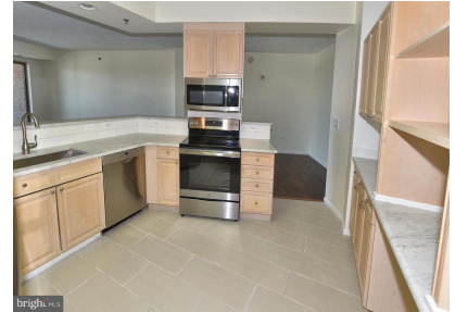
Space enough for more than one chef!