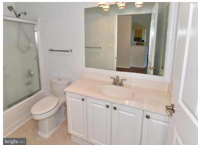
Second full bath serves guests and 2nd bedroom.