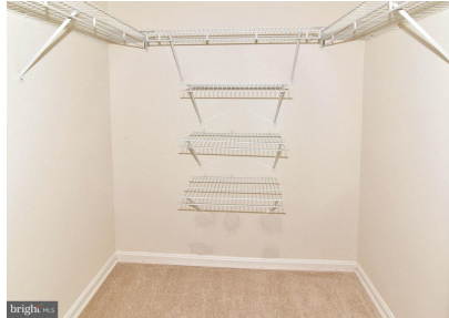
Huge walk in closet in your master bedroom.