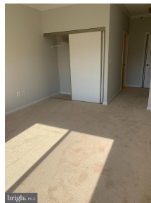
Owner's Bedroom with Closet #3