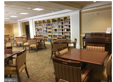
Overlook Party-Meeting Room