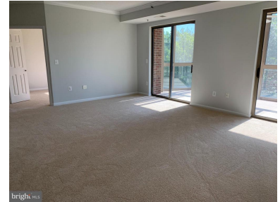
Great Room and Entry to Bedroom #3