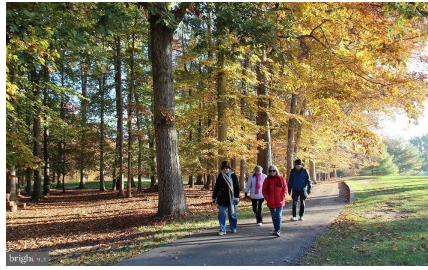
Perambulating through Leisure World