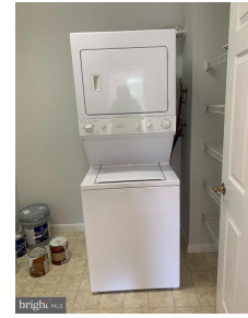
Separate Laundry Room