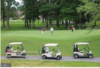
18-Hole Golf Course