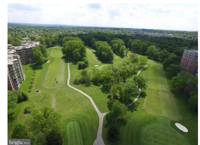
Golf Course - Aerial View