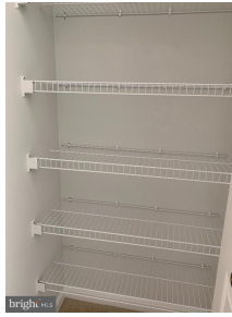
Owner's Bedroom Closet #2!