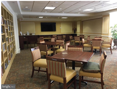
Overlook Party-Meeting Room