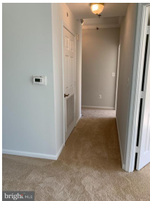
Hall To Secondary Bedrooms, Bath, & Laundry