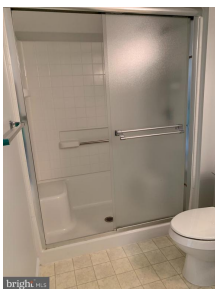
Bath #2 with Step-In Shower