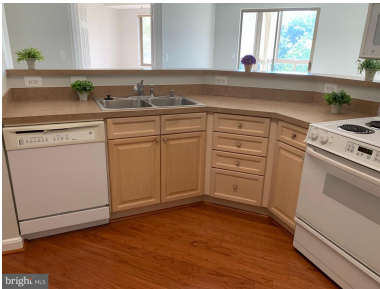
Kitchen Overlooks Great Room