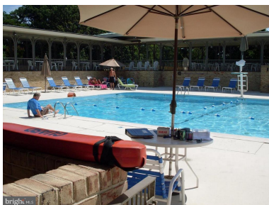
Clubhouse 1 Outdoor Pool