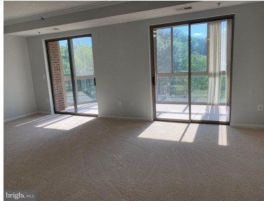
Great Room with Double Entry to Enclosed Balcony