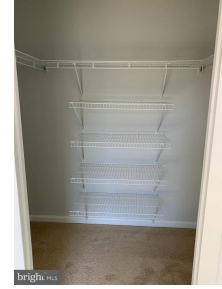
Bedroom #2 Has A Walk-In Closet!