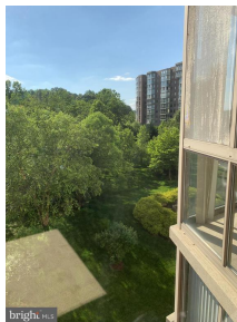
View From Bedroom #3