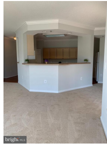
Great Room Looking Into Kitchen