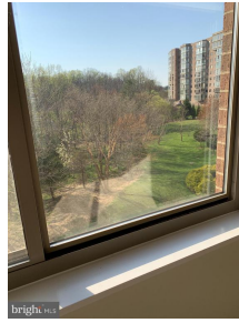
#2 Bedroom View