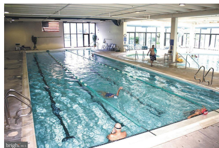
Clubhouse 2 Swim Center