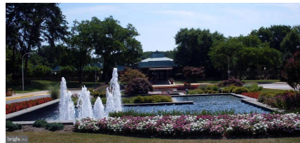
Clubhouse 1 Fountain