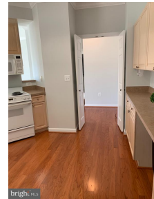
So Much Cabinet Space!