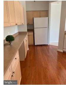
Looking Into Kitchen From Foyer