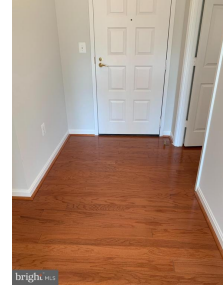
Wood-Floored Entry Foyer