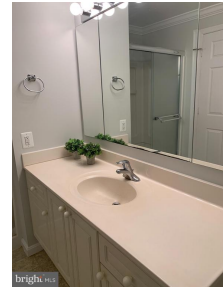
Owner's Bath with Wide Vanity