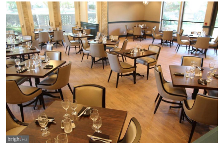
Clubhouse 1 Clubhouse Grille