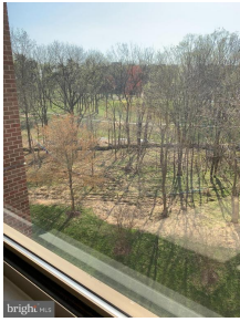
#2 Bedroom View