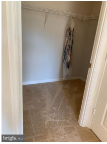
Owner's Bedroom Walk-In Closet