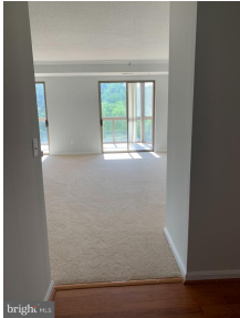
Looking Into Great Room from Foyer