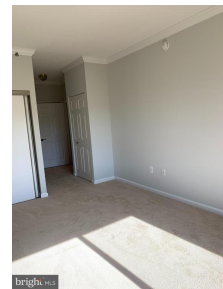
Owner's Bedroom Sunny and Bright!