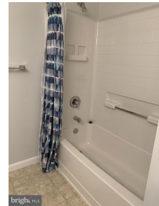
Owner's Bath with Separate Tub/Shower