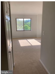
Looking into Owner's Bedroom