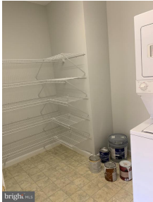
Laundry Room has Lots of Storage!