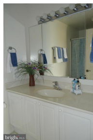
Guest Full Bath