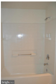
Master Bathroom Tub/ Shower