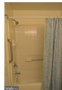
Guest Full Bath