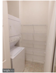
Laundry closet with shelving for added storage