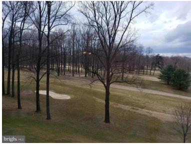
Gorgeous Views of the Golf Course