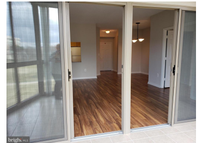
Double Sliders from LR to Enclosed Balcony