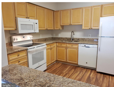
Large Table Space Kit w/Updated Appliances