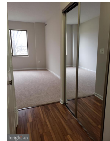
Master Bedroom has Lots of Closet space