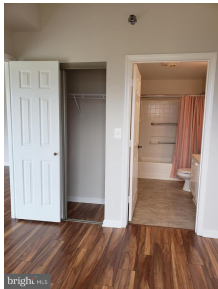
Bedroom/Den Closet with Full Bath