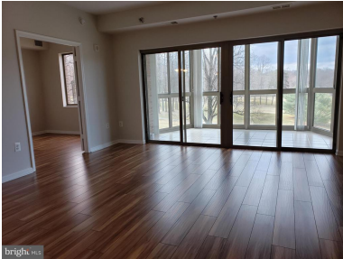
Can't get enough of the beautiful "New" Floors