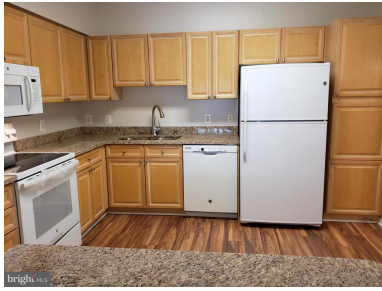
A peek thru the window..