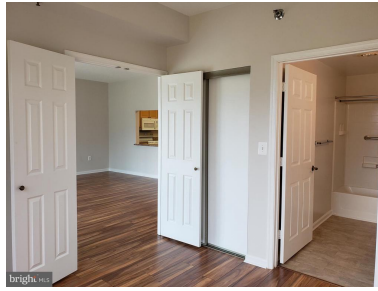
Bedroom/Den w/Double Door access to LR "New" Laminate/Wood Flooring in 2nd Bedroom/Den