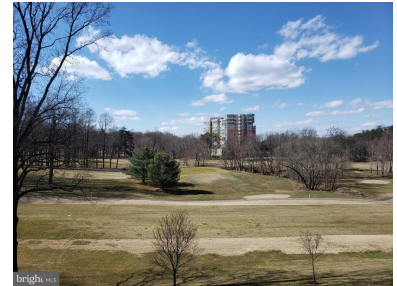
Expansive View of Golf Course