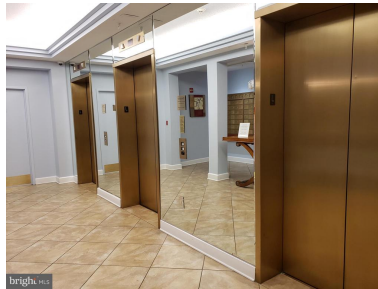
Three elevators to service the building residents