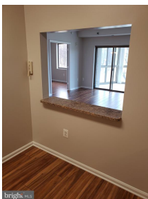
Kitchen window w/Granite shelf