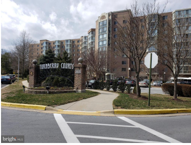
Turnberry Courts III