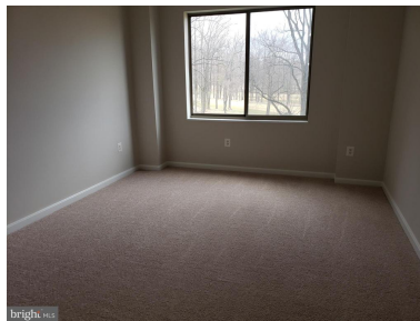
Master Bedroom has View of Golf Course