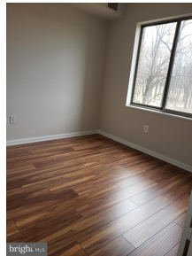
Bedroom/Den w/Laminate/Wood Floors