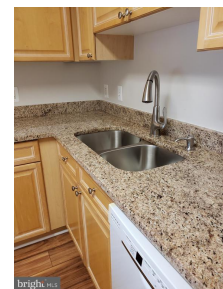
"Newly Installed" Granite/Sink/Faucet