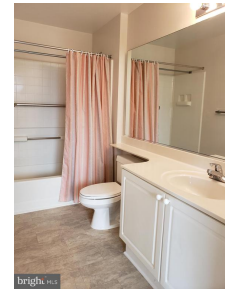
Bedroom/Den has Full Bath