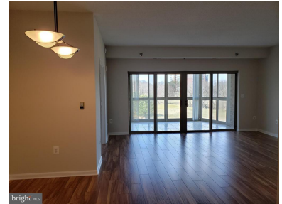
View thru LR to Enclosed Balcony