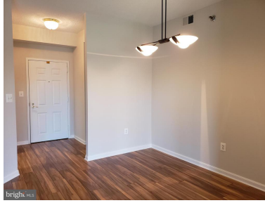
Entrance Foyer w/Laminate/Wood Floor