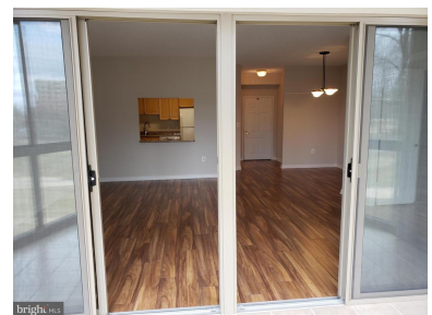
Love light & open feeling of these Double Sliders