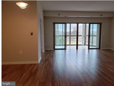
View of LR out to Enclosed Balcony