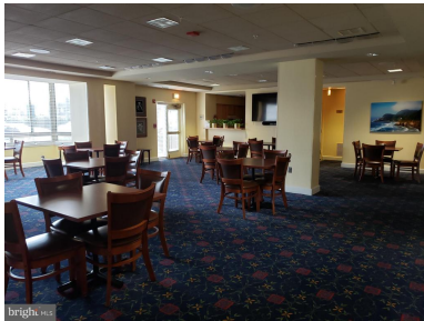
Bldg Community Room has a Full Service Kitchen