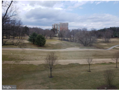
Check out how far you can see....