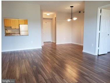
"New" Laminate/Wood Flooring in LR & DR