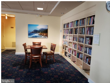
Bldg Community Room has a library