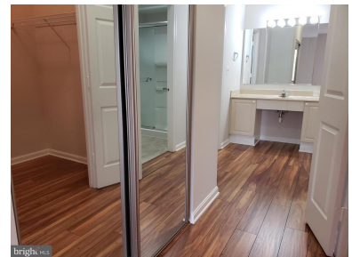
Master Bedroom has Spacious Dressing Room/Vanity