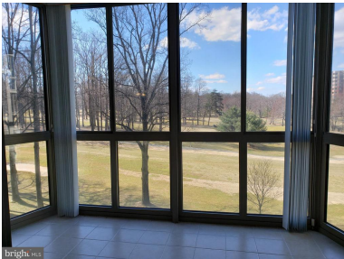
Enclosed Balcony w/Ceramic Tile Floor/Ceiling Fan Such a great space to enjoy your morning coffee.