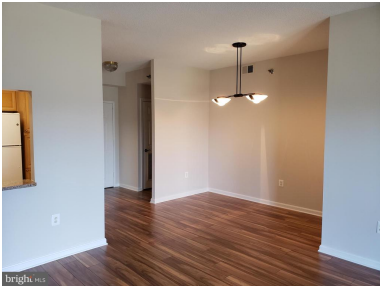
"New" Laminate/Wood Flooring in DR & Foyer