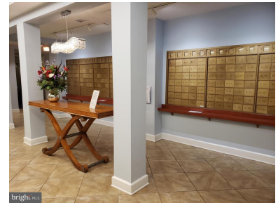
The Mail Room