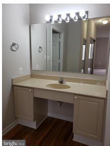
Master Bath Vanity