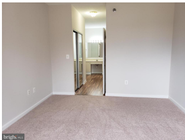
Fresh "New" Neutral Wall-to-Wall Carpet in MBR