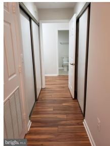
Hallway between Foyer & MBR