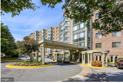
Welcome to Turnberry Courts!