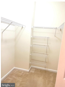
Large Walk-in closet