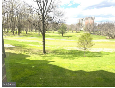
View From Your Balcony