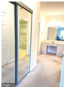
Closet and Vanity