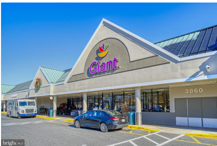
Grocery shopping is simple and close-by