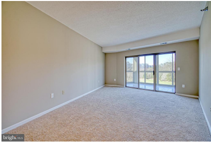
The top floor means no neighbors above!