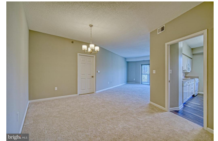
Fresh, neutral paint throughout the unit