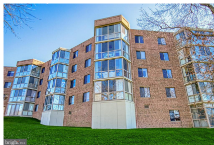
A view from the back side - Unit is on top floor