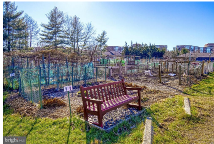
Reserve your own personal on campus gardening plot Clubhouse entrance - there are 2 clubhouses!