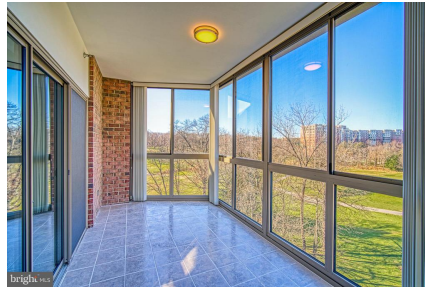
Enclosed balcony offers stunning golf course view