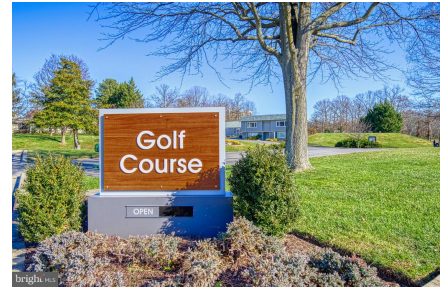
The golf course is a perfect community centerpiece