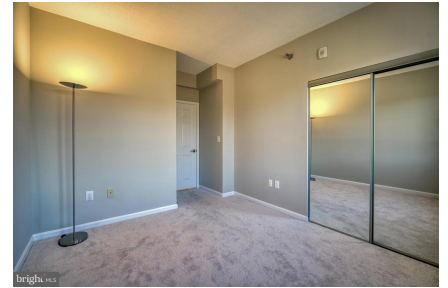
Bedrooms are on opposite sides of unit for privacy