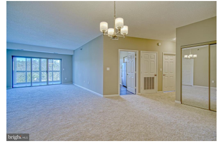
Open living and dining room floor plan