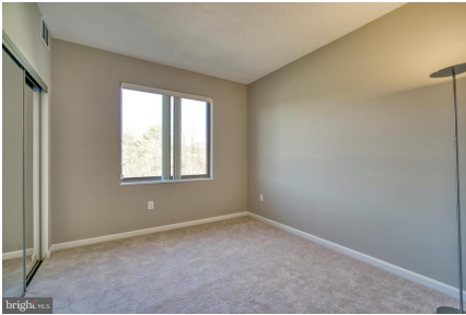
Second bedroom can easily hold double or queen bed