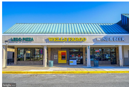
The plaza also has a post office & restaurants