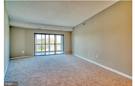
Sliding doors offer plenty of natural light