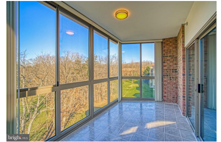
Watch all the seasons or the stars from here