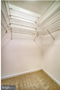
Bright walk-in can store clothes for every season This bathroom has the always needed storage space