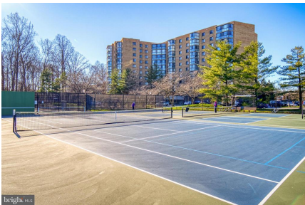
Amateurs and aces are welcome to play tennis here