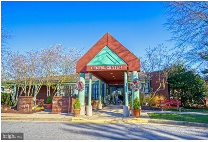
Leisure World has on-site dental care