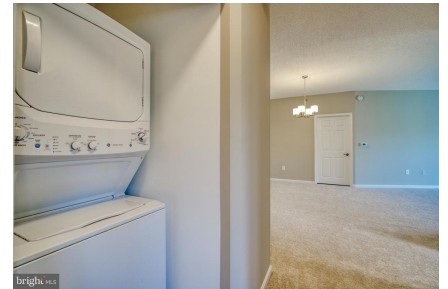
Convenient in-unit washer/dryer