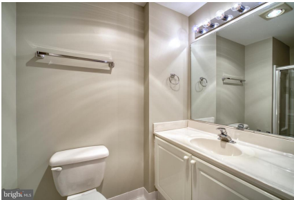
Well-lit guest/secondary bath