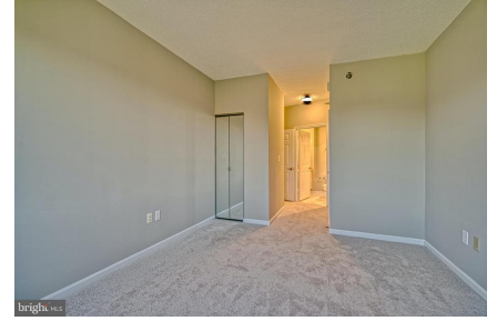
There are two additional closets, plus the walk-in