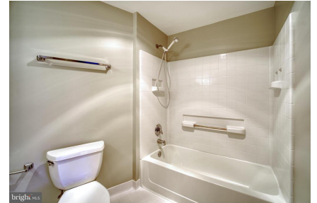
Owner's suite bath has tub/shower combo