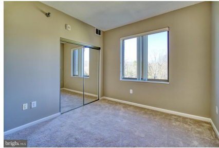
Mirrored closet doors reflect the natural light