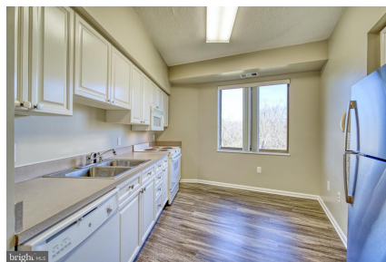
Enjoy space for a small bistro table or shelves