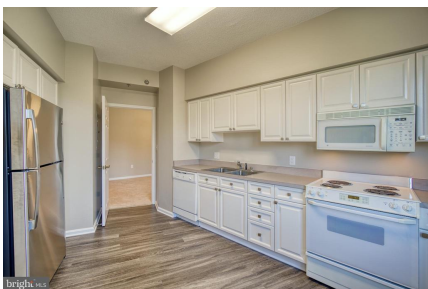
Updated vinyl plank flooring in the kitchen