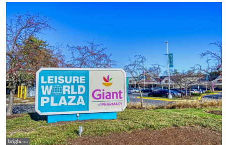
Outside the main gate are all the conveniences