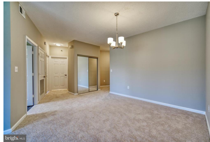
Entertain for the holidays in your dining room