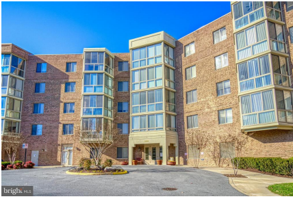
Welcome to Turnberry Courts in Leisure World