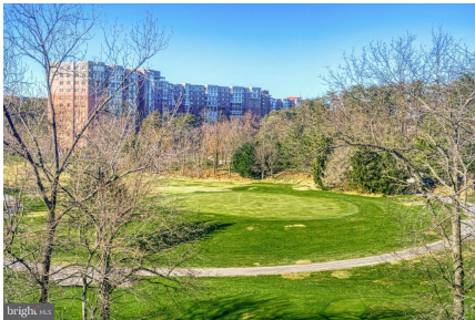
What a view!