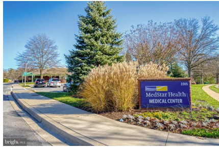
Leisure World campus has on-site medical care