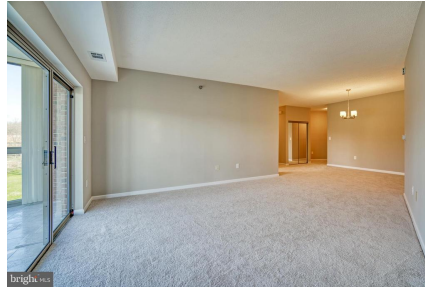
Brand new carpet