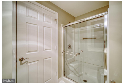
Walk-in shower is nice option