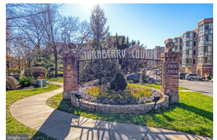
Beautiful landscaping throughout Leisure World