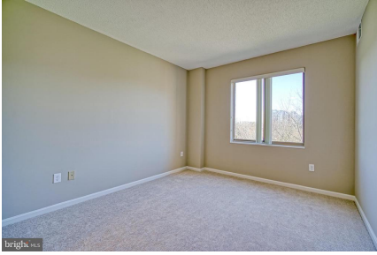
Owner's suite has the same stunning view