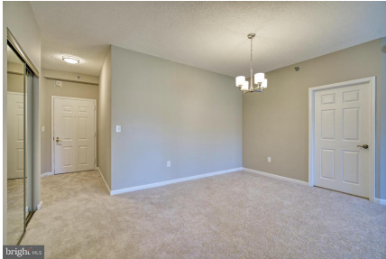
New dining room light fixture has updated style