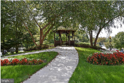
Beautiful scenic gardens