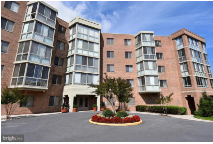
Welcome to 2904 N. Leisure World Blvd