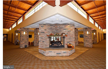
Community center inside