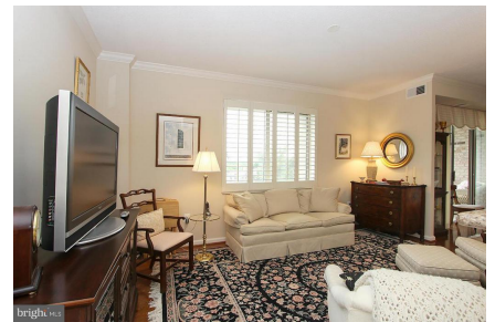
OR FAMILY ROOM