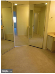
Mstr bdrm dressing area w/mirrored closet doors.