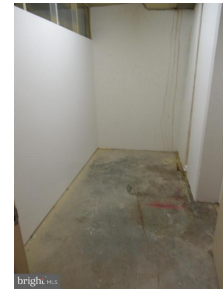
Private Storage Room #49. Approx 8'x4'10".