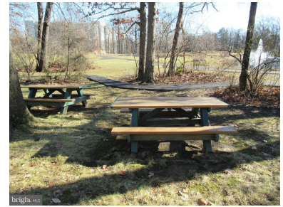
Picnic area outside the main building entrance