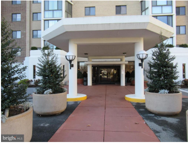
Main entrance to build. Can drive under the canopy