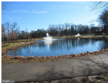
Golf course ponds & walking area, outside front