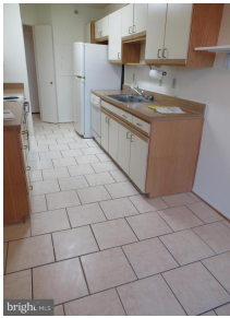
Galley Kitchen, view towards foyer.