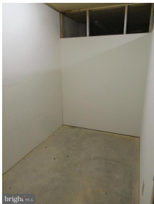
Private Storage Room #46. Approx 10'x4'10".