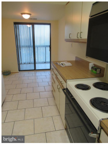
Kitchen. View towards table space area.