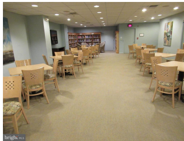
Bldg community room. Games, movies, etc