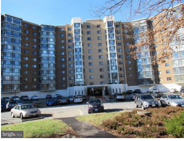
10 story build surrounded by trees, walking areas Private storage room. 2 rooms included in price.