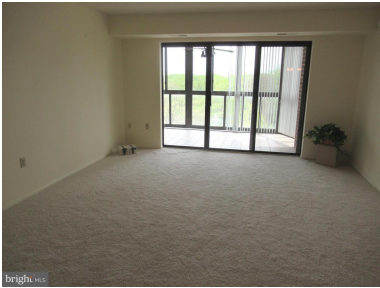
Liv rm. 16'x12' New carpet, fresh paint thru out.