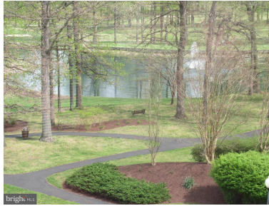
Walking trails along the ponds.