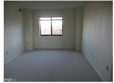
3rd bedroom. 15'x10'. New carpet.