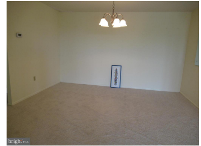
Dining room. 12'x13'. New carpet.