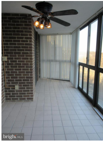
Glass enclosed balcony. 20'x9'.