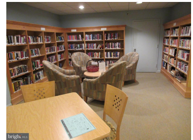
Bldg community library area