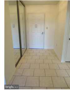
Foyer w/mirrored closet door. Tile floor.