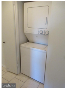
Stacked washer & dryer.