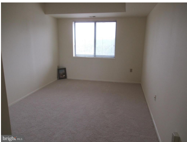
2nd bedroom. 13'x9'. New carpet.