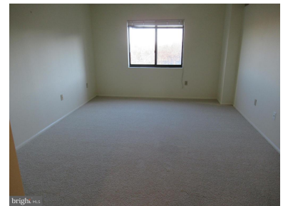
Master bedroom. 16'x12'. New carpet.