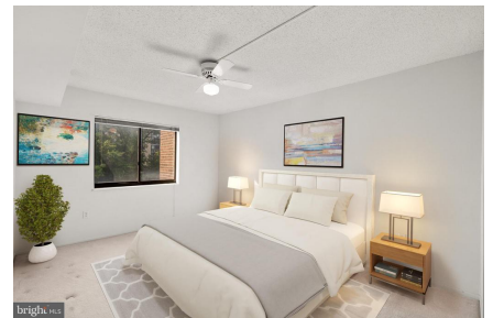
Virtual Staged Owner's Bedroom