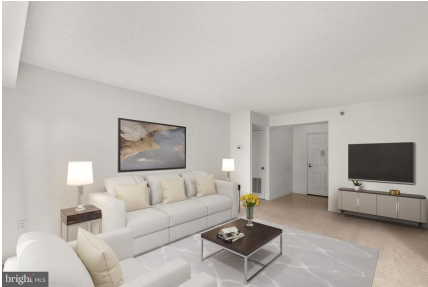
Virtual Staged Living Room