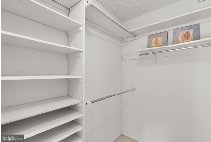
Primary Bedroom Walk In Closet