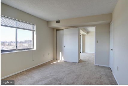
Second bedroom, view 2