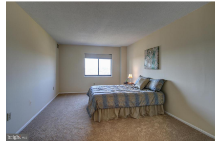
Master bedroom with new carpet and paint