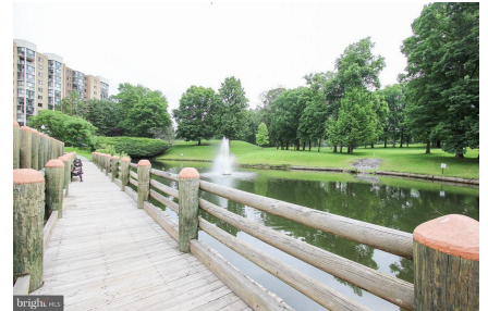
Fountain and lake at front of building