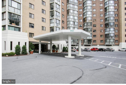
Greens Bldg 1 Covered Entrance