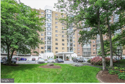
Greens Bldg 1 Exterior