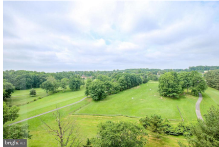
Scenic view from condo