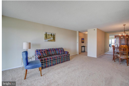
Living room with new paint and carpet