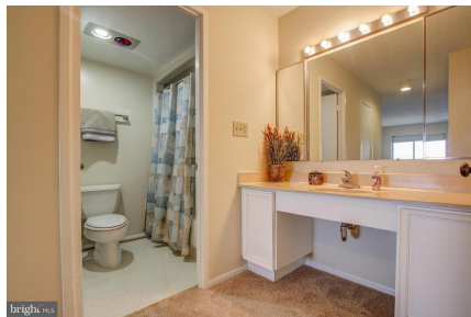
Master bathroom and separate dressing vanity