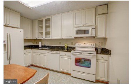
Kitchen with updated cabinets and appliances