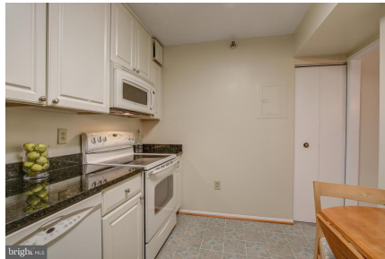
Kitchen has granite counters