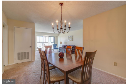
Dining room, view 2