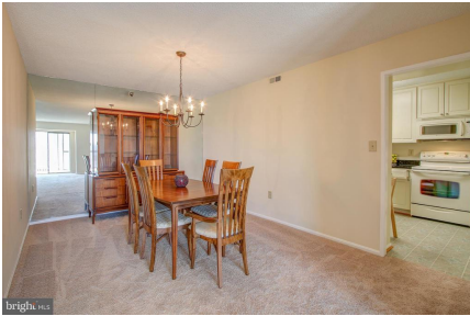
Dining room with mirrored back wall