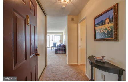
Entry foyer with large coat closet