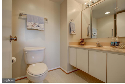
Second bathroom with vanity and shower