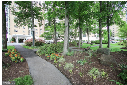
Front entrance walkway