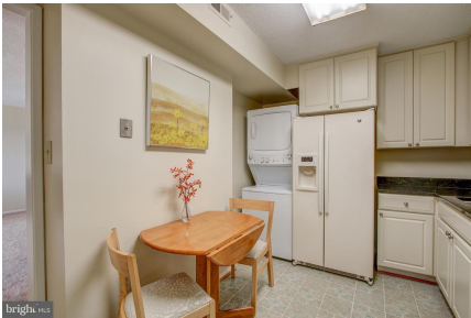
Kitchen, view 2