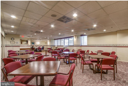
Building community room