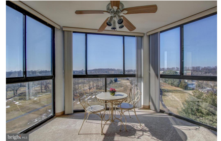
Sunroom with gorgeous, scenic views