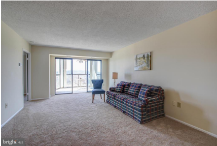
Living room with slider to glass-enclosed sunroom