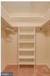
Master bedroom walk-in closet