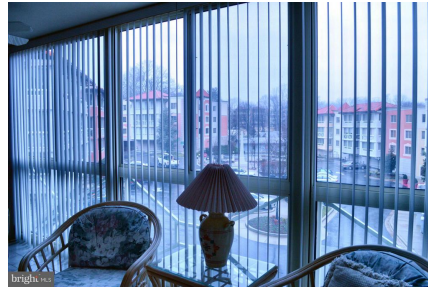
View from Sunroom