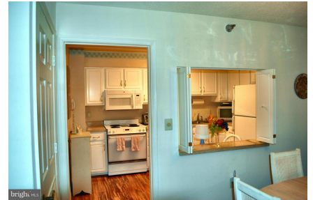
Kitchen / Dining Room