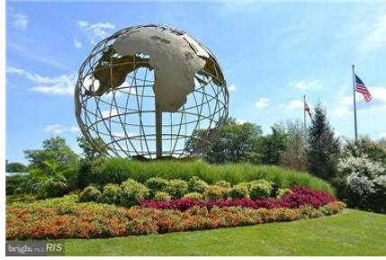
Leisure World of Maryland Main Entrance