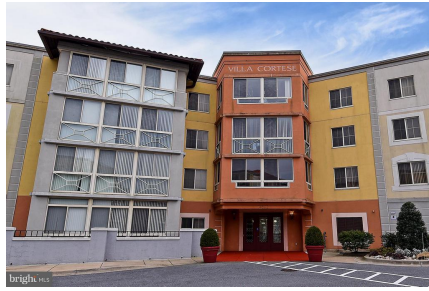
Building Front Entrance