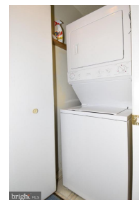
Washer & Dryer