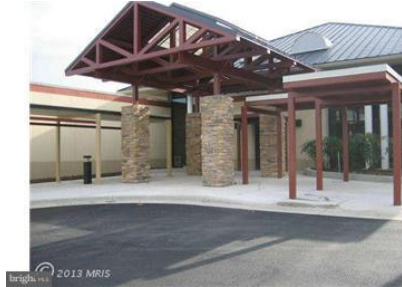
Club House II