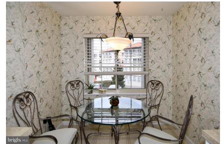
Table Space Kitchen