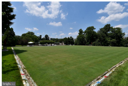
Club House I