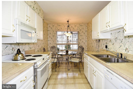
Table Space Kitchen