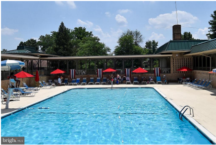
Outdoor Swimming Pool