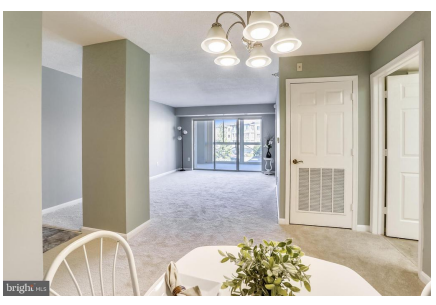
Dining area and Living room