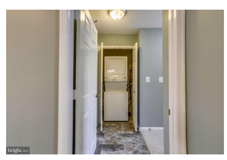
Washer and Dryer