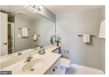
Large bathroom with Shower