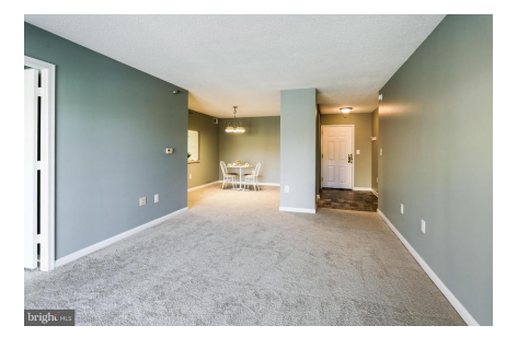
Large living room