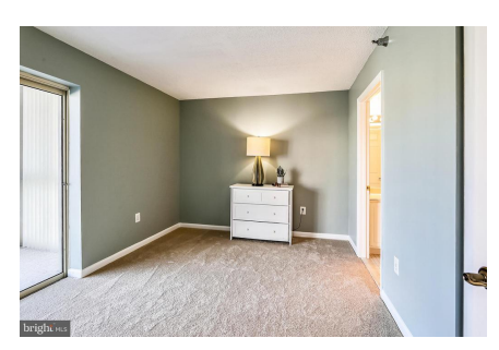
Large Second bedroom with walk out to balcony