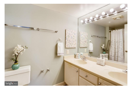
bathroom with tub and double sink