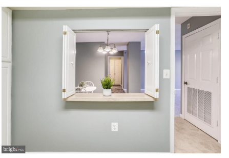
Open view into Kitchen