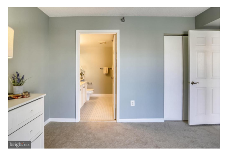
Second bedroom with bathroom with Shower