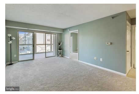
Large Living Room that opens to large balcony Table space kitchen with open view to dining area