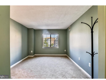
Bedroom with ample closets