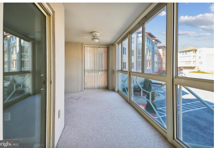
Large Balcony for relaxing or entertaining